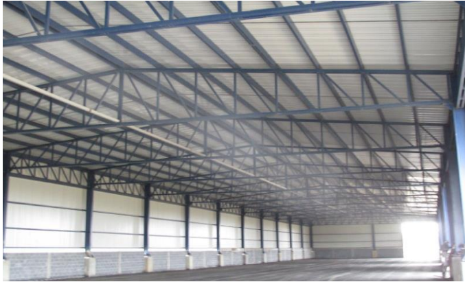
Indoor Warehouse 22,300 Sq. Ft.